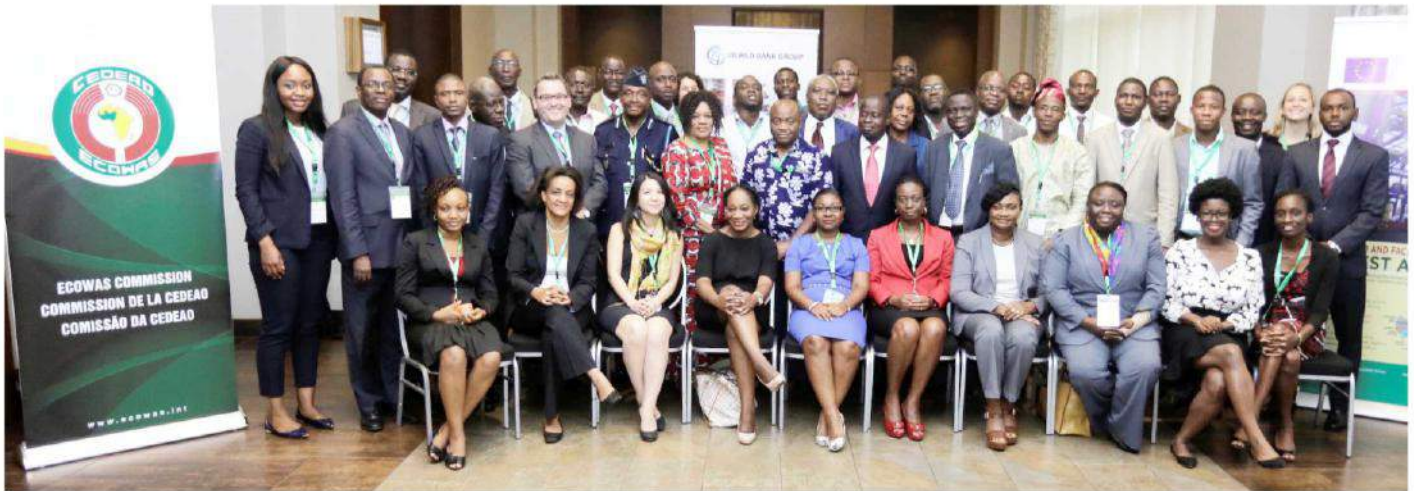
A group photograph of the participant at the meeting in Accra - Ghana

The Economic Community of West African States (ECOWAS) and the World Bank Group co-hosted a technical workshop in Ghana from June 7–8, under the Improved and Facilitated Trade in West Africa Project. The project aims to unlock transit challenges across key trade corridors in West Africa. Over 40 participants, including representatives from the ECOWAS and the West Africa Economic Monetary Union (WAEMU) Commissions, the European Union, the World Bank Group, and stakeholders from the public and private sectors along the three main trade corridors in Benin, Burkina Faso, Côte d'Ivoire, Niger, and Ghana, attended the two-day event.