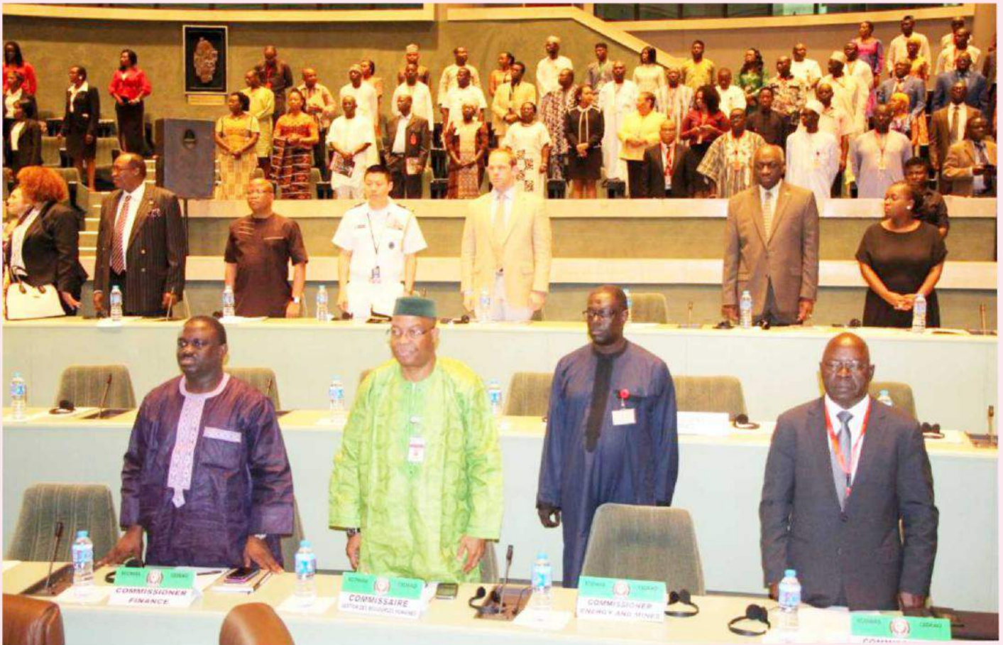
A cross section of ECOWAS Staff and Members of the Diplomatic Corps.

evolution of ECOWAS and gave a rundown of the ECOWAS trajectory since inception surmising that the regional group is “perhaps the single most important collective achievement in independent West Africa” He maintained that the watchful world was quite satisfied with the fact that ECOWAS has established the nexus between peace and development and between conflict and stability and progress.