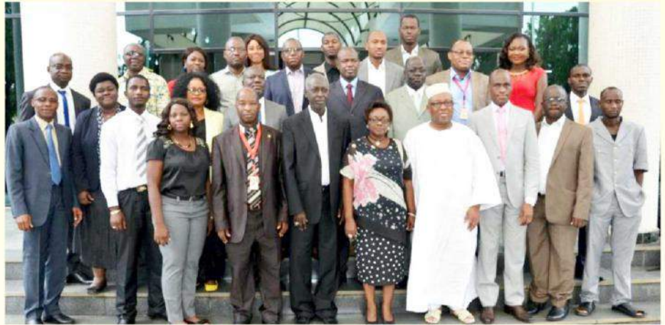
A group Photograph of participants at the meeting

The Commissioner urged the stakeholders to use the opportunity of the workshop to reinforce the various actions conducted in the region to combat adverse effects of climate change with emphasis on the implementation of the Paris Agreement and the climate funds made available at the global level. He also expressed his gratitude to the